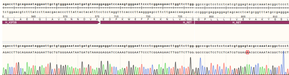
Figure 2 | The KIF5B-RET mutation analysis by Sanger sequencing.